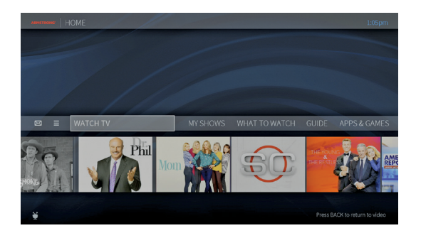
NO VIDEO ON HOME SCREEN